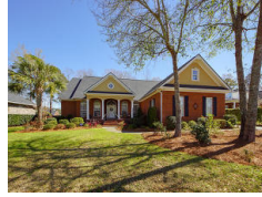
8721 Herons Walk North Charleston SC