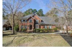
4218 Buck Creek Court North Charleston SC