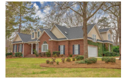
4224 Wildwood Landing Charleston SC