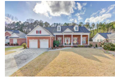
4213 Wildwood Landing North Charleston SC