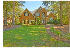
4224 Sawgrass Drive North Charleston SC