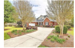
4211 Club Course Drive North Charleston SC