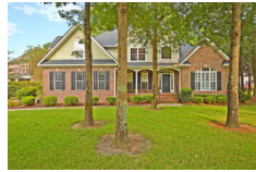
8781 Herons Walk North Charleston SC