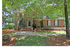
4427 Wild Thicket Lane North Charleston SC