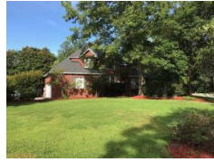
4211 Persimmon Woods Drive North Charleston SC