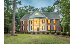
4293 Club Course Drive North Charleston SC