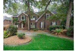
8681 Arthur Hills Circle North Charleston SC