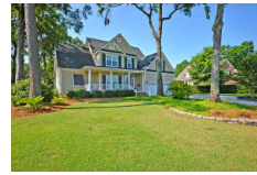
8931 E Fairway Woods Drive North Charleston SC