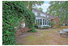
8630 Arthur Hills Circle North Charleston SC