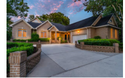
4204 Persimmon Woods Drive North Charleston SC