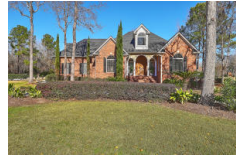
8612 Timbermarsh Lane North Charleston SC