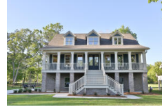
4273 Club Course Drive North Charleston SC