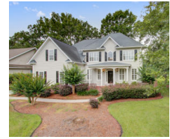
8859 E Fairway Woods Circle North Charleston SC