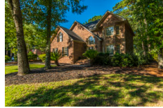
8684 Arthur Hills Circle North Charleston SC