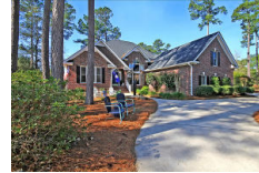
4211 Sweet Gum Crossing North Charleston SC