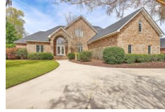
4208 Club Course Drive North Charleston SC