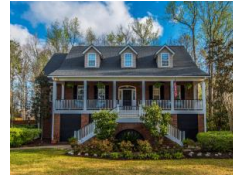
4245 Wildwood Landing North Charleston SC