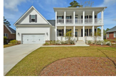
8831 E Fairway Woods Drive North Charleston SC