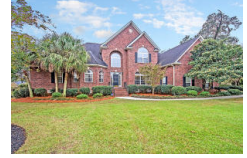
4232 Club Course Drive North Charleston SC