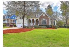
8911 E Fairway Woods Drive North Charleston SC