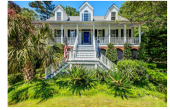
4285 Club Course Drive North Charleston SC