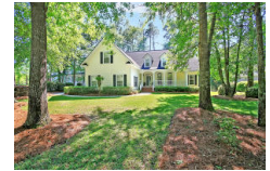
8895 E Fairway Woods Circle North Charleston SC