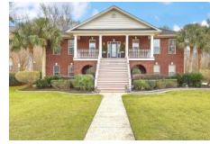
4207 Club Course Drive North Charleston SC