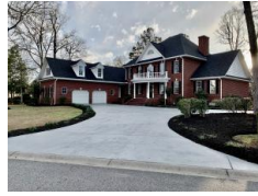
4312 Persimmon Woods Drive North Charleston SC