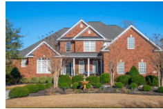
4219 Club Course Drive North Charleston SC