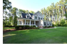
1003 King Mountain Drive Summerville SC