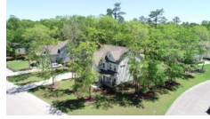
5550 Alpine Drive Summerville SC