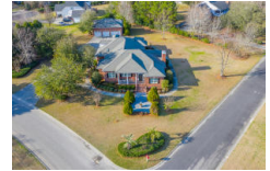
1021 Mount Mckinley Drive Summerville SC