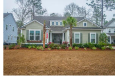
4027 Cascades Thrust Summerville SC