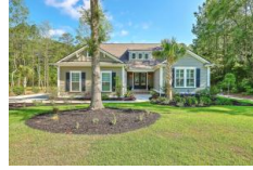
5557 Alpine Drive Summerville SC