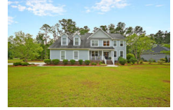
1000 Poconos Court Summerville SC