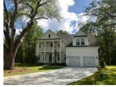
4030 Cascades Thrust Summerville SC