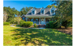
1001 Bryce Court Summerville SC