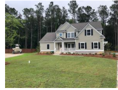
1009 Denali Court Summerville SC