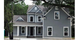
3043 Rampart Road Summerville SC