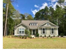
3031 Rampart Road Summerville SC