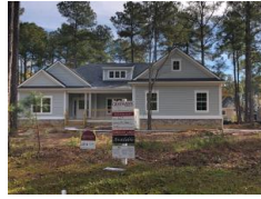
1001 Denali Court Summerville SC