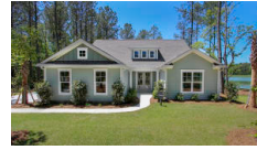
5512 Alpine Drive Summerville SC