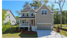
5500 Alpine Drive Summerville SC