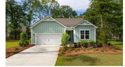
5060 Alpine Drive Summerville SC