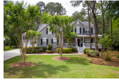
5279 Alpine Drive Summerville SC