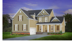
5566 Alpine Drive Summerville SC