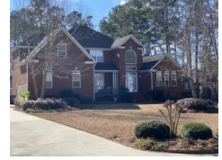
1002 Poconos Court Summerville SC