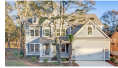
3007 Rampart Road Summerville SC