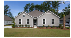
3032 Rampart Road Summerville SC