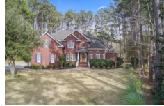
1015 Englewood Court Summerville SC