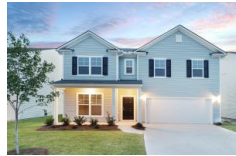
116 Hayworth Road Summerville SC