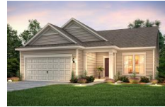
115 Potters Pass Drive Summerville SC