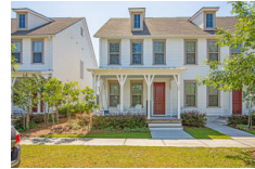
165 Great Lawn Drive Summerville SC