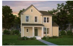
334 Great Lawn Drive Summerville SC