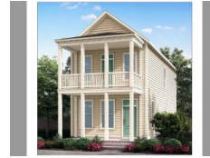
223 Winding Branch Drive Summerville SC