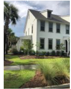
248 Oak Park Street Summerville SC