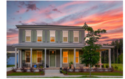
524 Scholar Way Summerville SC