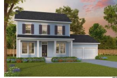
711 Pine Bark Lane Summerville SC