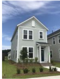
209 Winding Branch Drive Summerville SC