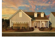
435 Hidden Meadow Lane Summerville SC