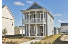
369 Oak Park Street Summerville SC