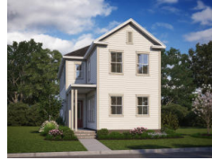
337 Great Lawn Drive Summerville SC