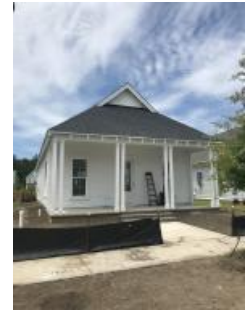
409 Gray Bark Road Summerville SC