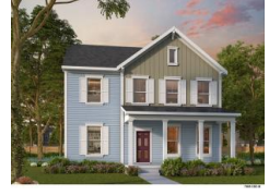
611 Heartwood Lane Summerville SC