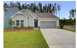
221 Dunlin 201 Drive Summerville SC