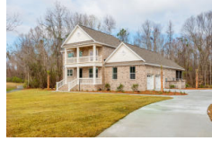
4205 Links Court North Charleston SC