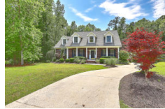
4222 Buck Creek Court North Charleston SC