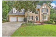
8627 W Fairway Woods Drive North Charleston SC