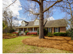
8642 Arthur Hills Circle Charleston SC