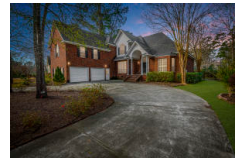
8728 E Fairway Woods Drive North Charleston SC