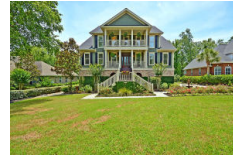
4165 Club Course Drive North Charleston SC