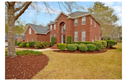
4412 Club Course Drive North Charleston SC