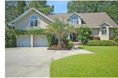
8855 E Fairway Woods Dr North Charleston SC