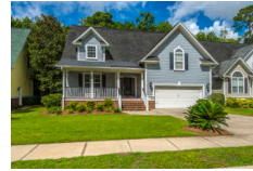
8619 Woodland Walk North Charleston SC