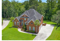
4202 Magnolia Court North Charleston SC