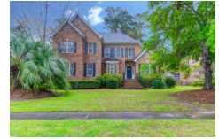
4407 Wild Thicket Lane North Charleston SC