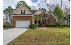
8749 Herons Walk North Charleston SC