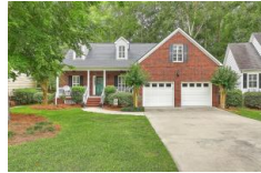
8611 Woodland Walk North Charleston SC