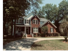
8791 East Fairway Woods Circle North Charleston SC