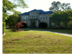
4213 Sawgrass Drive North Charleston SC