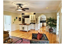
8604 Wild Bird Court North Charleston SC