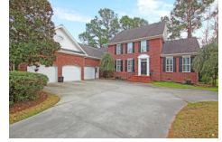
4258 Club Course Drive North Charleston SC