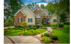
8642 W Fairway Woods Drive North Charleston SC