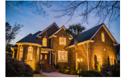
8827 E Fairway Woods Drive North Charleston SC