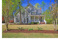
8748 E Fairway Woods Cir North Charleston SC