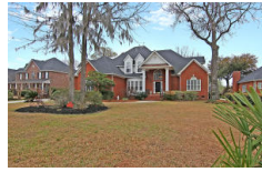
4248 Club Course Drive North Charleston SC