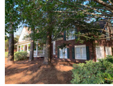
4420 Club Course Drive North Charleston SC