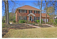
8619 Arthur Hills Circle North Charleston SC