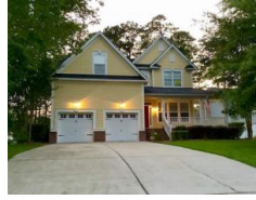
8756 Herons Walk North Charleston SC