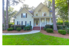
8756 E Fairway Woods Circle North Charleston SC