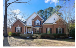
8843 E Fairway Woods Drive North Charleston SC