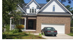
8612 Woodland Walk North Charleston SC