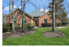
4200 Persimmon Woods Drive North Charleston SC