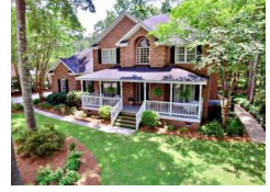
8607 Arthur Hills Circle Charleston SC