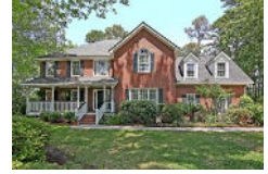
4239 Persimmon Woods Drive North Charleston SC