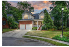
8604 Fox Hollow Road North Charleston SC