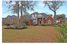
4248 Club Course Drive North Charleston SC