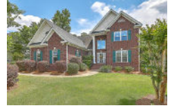
4173 Club Course Drive North Charleston SC