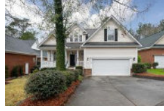
8639 Woodland Walk North Charleston SC