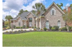
4212 Club Course Drive North Charleston SC