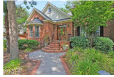
8769 Herons Walk North Charleston SC