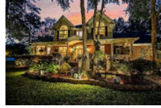
4217 Meadowbrook Court North Charleston SC