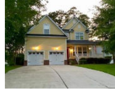
8756 Herons Walk North Charleston SC