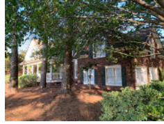
4420 Club Course Drive North Charleston SC