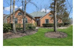
4200 Persimmon Woods Drive North Charleston SC