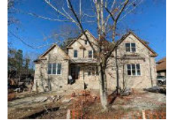
4160 Club Course Drive North Charleston SC