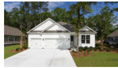
5520 Alpine Drive Summerville SC