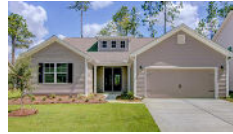
5496 Alpine Drive Summerville SC