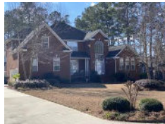
1002 Poconos Court Summerville SC