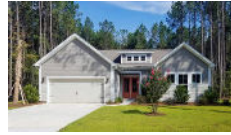
3001 Rampart Road Summerville SC