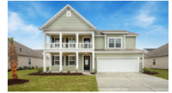
5541 Alpine Drive Summerville SC