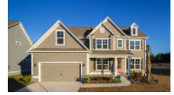
5495 Alpine Drive Summerville SC