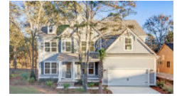
3007 Rampart Road Summerville SC