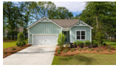
5060 Alpine Drive Summerville SC