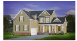
3025 Rampart Road Summerville SC