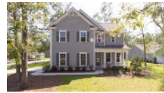
5562 Alpine Drive Summerville SC