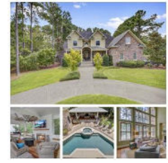
1008 Denali Court Summerville SC