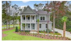
3052 Rampart Road Summerville SC