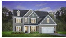
5565 Alpine Drive Summerville SC