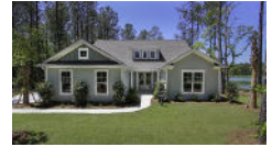
5529 Alpine Drive Summerville SC