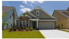
5517 Alpine Drive Summerville SC