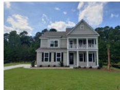
5497 Alpine Drive Summerville SC