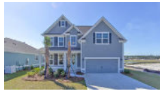
5537 Alpine Drive Summerville SC