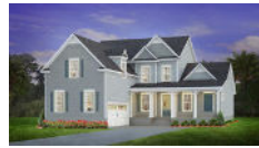
5561 Alpine Drive Summerville SC