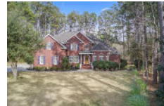
1015 Englewood Court Summerville SC