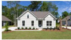
3040 Rampart Road Summerville SC