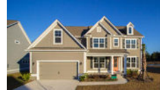
5513 Alpine Drive Summerville SC