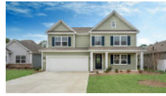
5521 Alpine Drive Summerville SC