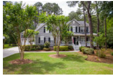
5279 Alpine Drive Summerville SC