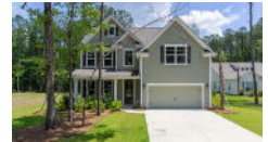
5505 Alpine Drive Summerville SC