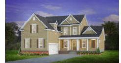
5566 Alpine Drive Summerville SC