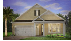
5533 Alpine Drive Summerville SC