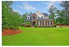
1009 King Mountain Drive Summerville SC