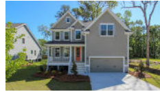
5500 Alpine Drive Summerville SC