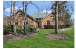
4200 Persimmon Woods Drive North Charleston SC