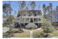
8903 E Fairway Woods Drive North Charleston SC