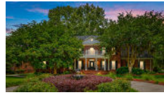
8600 Wild Bird Court North Charleston SC