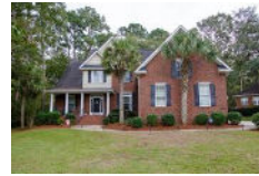
8618 W Fairway Woods Drive North Charleston SC