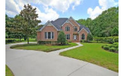
8625 Wild Bird Court North Charleston SC