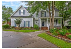
8891 E Fairway Woods Drive North Charleston SC