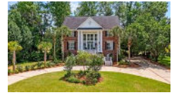
4205 Sawgrass Drive Drive Charleston SC