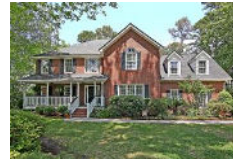
4239 Persimmon Woods Drive North Charleston SC