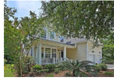
8629 Woodland Walk North Charleston SC