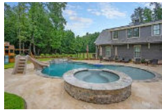
8644 Scottish Troon Court North Charleston SC