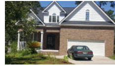
8612 Woodland Walk North Charleston SC