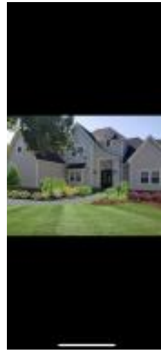
4234 Club Course Drive North Charleston SC