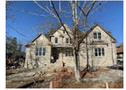
4160 Club Course Drive North Charleston SC