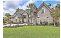
4212 Club Course Drive North Charleston SC