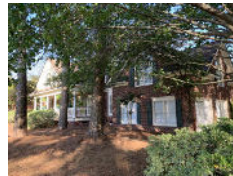
4420 Club Course Drive North Charleston SC