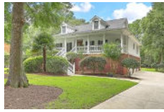
8639 W Fairway Woods Drive North Charleston SC