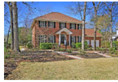
8619 Arthur Hills Circle North Charleston SC