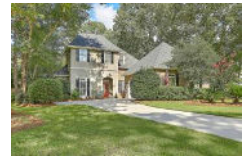
4205 Meadowbrook Court North Charleston SC