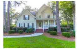
8756 E Fairway Woods Circle North Charleston SC