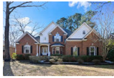
8843 E Fairway Woods Drive North Charleston SC