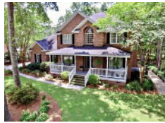
8607 Arthur Hills Circle Charleston SC