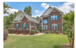
4173 Club Course Drive North Charleston SC