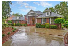
4164 Club Course Drive North Charleston SC