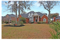
4248 Club Course Drive North Charleston SC