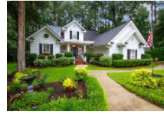
8645 Woodland Walk North Charleston SC