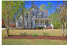
8748 E Fairway Woods Cir North Charleston SC