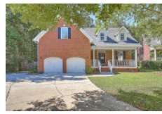
8631 Woodland Walk North Charleston SC