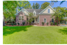
8847 E Fairway Woods Drive North Charleston SC