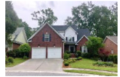
8622 Woodland Walk North Charleston SC