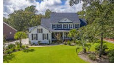
4227 Sawgrass Drive North Charleston SC