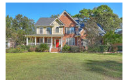
8745 Herons Walk North Charleston SC