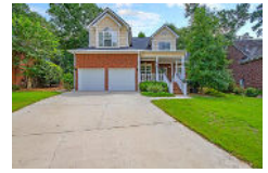
8604 Fox Hollow Road North Charleston SC