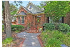
8769 Herons Walk North Charleston SC