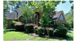
4219 Buck Creek Court North Charleston SC