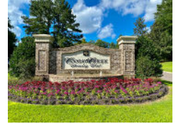
4218 Buck Creek Court Charleston SC