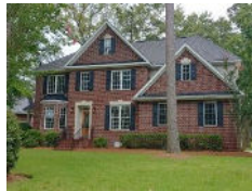
8704 E Fairway Woods Drive North Charleston SC