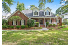
4280 Club Course Drive North Charleston SC