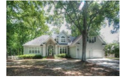
8645 Arthur Hills Circle North Charleston SC