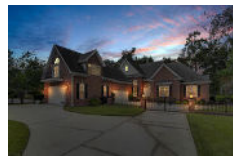
4251 Club Course Drive North Charleston SC