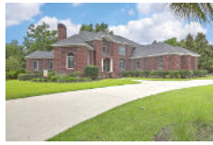
4224 Club Course Drive North Charleston SC