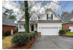
8639 Woodland Walk North Charleston SC