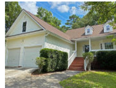
8608 Woodland Walk North Charleston SC