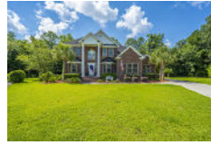
4204 Magnolia Court North Charleston SC