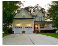
8756 Herons Walk North Charleston SC