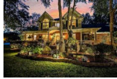
4217 Meadowbrook Court North Charleston SC