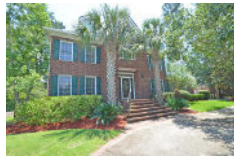
4312 Club Course Drive North Charleston SC