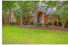
4296 Club Course Drive North Charleston SC