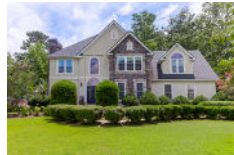
8696 W Fairway Woods Drive North Charleston SC