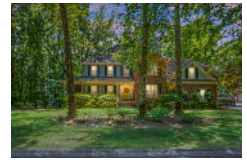
8603 W Fairway Woods Drive Charleston SC