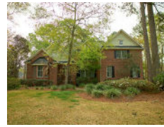
8769 Herons Walk North Charleston SC