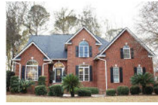
8712 E Fairway Woods Circle North Charleston SC