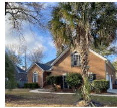
4237 Wildwood Charleston SC