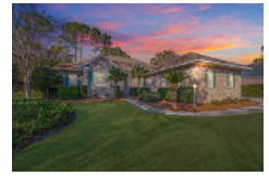
4223 Sawgrass Drive North Charleston SC