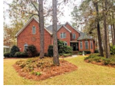
4205 Buck Creek Court North Charleston SC