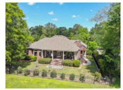
4133 Club Course Drive North Charleston SC