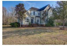
4213 Club Course Drive North Charleston SC