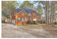
4601 Club Course Drive Drive Charleston SC