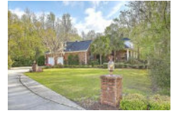
4207 Links Court North Charleston SC