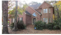
8684 Arthur Hills Circle North Charleston SC