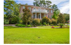
4263 Persimmon Woods Drive North Charleston SC