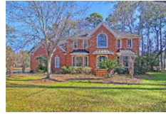
8614 Arthur Hills Circle North Charleston SC