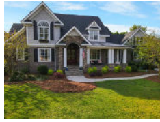
4238 Club Course Drive North Charleston SC