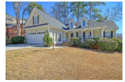
8618 Woodland Walk North Charleston SC