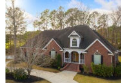
8760 E Fairway Woods Drive North Charleston SC