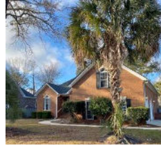
4237 Wildwood Charleston SC