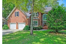
8623 Arthur Hills Circle North Charleston SC