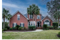
4212 Meadowbrook Court North Charleston SC