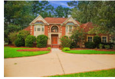
4207 Sweet Gum Crossing North Charleston SC