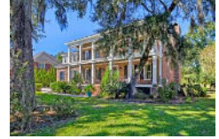
4235 Club Course Drive North Charleston SC