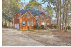
4601 Club Course Drive Drive Charleston SC