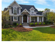
4238 Club Course Drive North Charleston SC