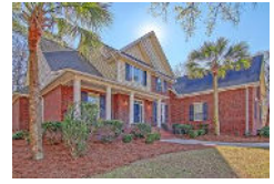
8618 W Fairway Woods Drive North Charleston SC