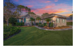
4223 Sawgrass Drive North Charleston SC