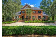
8602 Arthur Hills Circle North Charleston SC