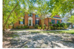
4211 Buck Creek Court North Charleston SC