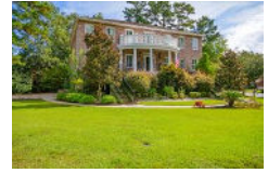
4263 Persimmon Woods Drive North Charleston SC