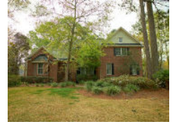
8769 Herons Walk North Charleston SC