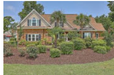
8638 Arthur Hills Circle North Charleston SC