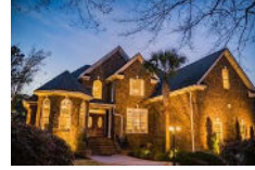
8827 E Fairway Woods Drive North Charleston SC