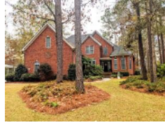
4205 Buck Creek Court North Charleston SC