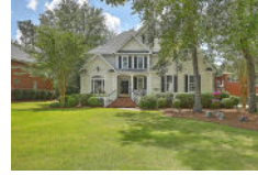
4274 Club Course Drive North Charleston SC