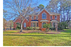
8614 Arthur Hills Circle North Charleston SC