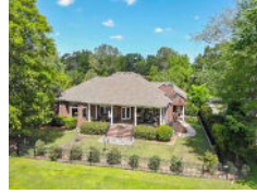
4133 Club Course Drive North Charleston SC