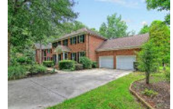
8619 Arthur Hills Circle North Charleston SC