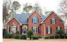
8712 E Fairway Woods Circle North Charleston SC