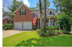
8602 Fox Hollow Road North Charleston SC