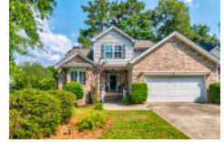
8601 Fox Hollow Road North Charleston SC