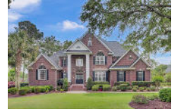
4260 Club Course Drive North Charleston SC