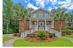
8618 Scottish Troon Court North Charleston SC