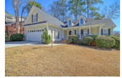
8618 Woodland Walk North Charleston SC