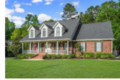
4220 Buck Creek Court North Charleston SC