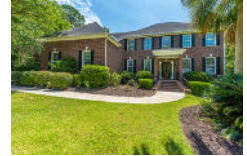
4221 Buck Creek Court North Charleston SC