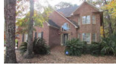
8684 Arthur Hills Circle North Charleston SC