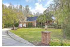
4207 Links Court North Charleston SC