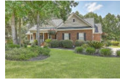
8617 Wild Bird Court North Charleston SC