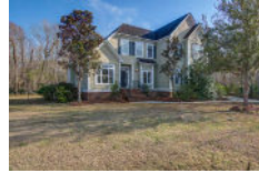
4213 Club Course Drive North Charleston SC